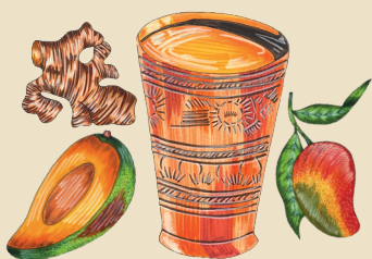
MANGO & GINGER