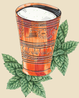
NAMAK Salted and delicately spiced, with mint.