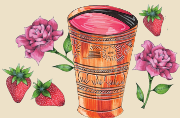
STRAWBERRY & ROSE